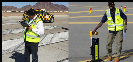
PART 139 AIRFIELD INSPECTION