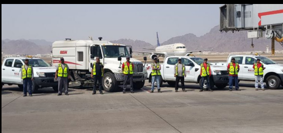
RUNWAY INSPECTION / FOD CONTROL