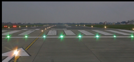
AGL / ELECTRICAL